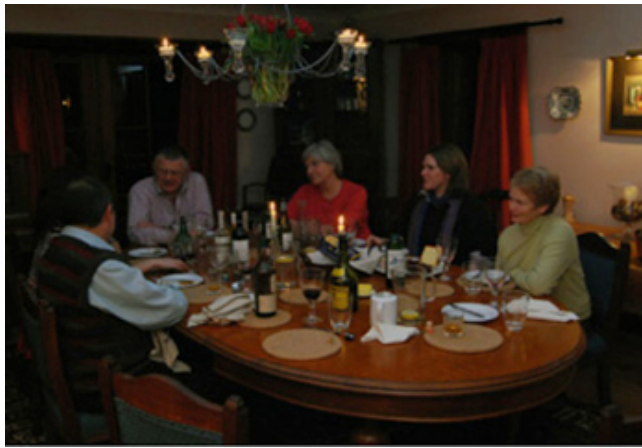
Dinner Party with Great Company